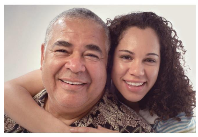
Information for Parents and Caregivers